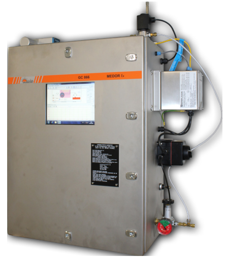
Model: A73022 Exp

BENZENE TOLUENE ETHYLBENZENE XYLENES (O,M,P)