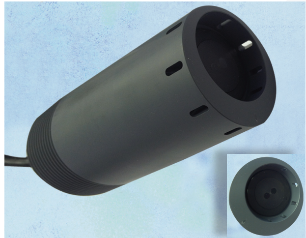
Submersible Turbidity Sensor

Extra Outputs/Relays. Expansion board to add a third 4-20 mA analog output or to add three additional non-isolated low power relays.