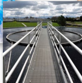
Potable Water Treatment