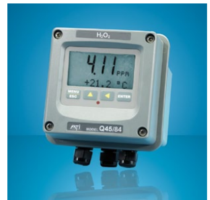
H 2 O 2 Loop-Powered Transmitter