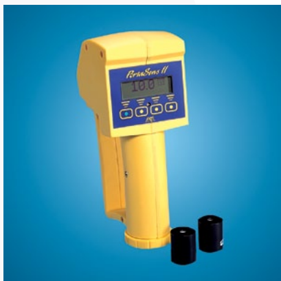
Portable H 2 O 2 Gas Detector

ATI also offers a loop-powered dissolved peroxide monitor for those applications where extra outputs and/or relays are not required. A battery powered portable unit is also available with an internal data logger for temporary monitoring applications. And for safety around your peroxide system, ATI manufactures a variety of portable and fixed point gas detectors.