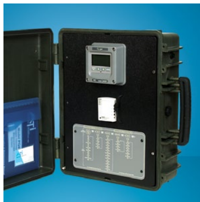
PQ45 Portable H 2 O 2 Data Logger