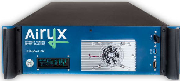
ICAD-NOx-210DL series featuring 19" rack housing and OLED display.