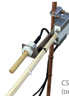
CS516-QD Fuel Sensor (ordered separately)