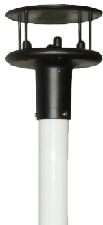
WindSonic-QD 2-D ultrasonic anemometer (ordered as Wind Sensor option -GW).

The 18897 wall charger can recharge the RAWS-F battery during off-season, winter-time storage. This wall charger has a 24 Vac, 1.67 A output and a 110 to 240 Vac input.