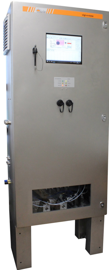
Model: V10022 (wall mounted version with gas generators)